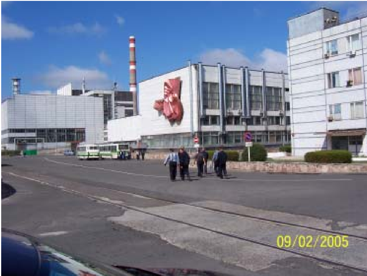
Workers and Shuttle Buses on the Other Side of the Stricken Chernobyl Plant